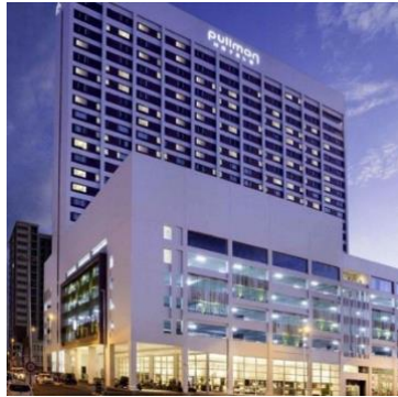
Pullman Miri Waterfront

discerning leisure and corporate participants. The 328 room full service hotel, 2 ballrooms, 5 state of the art function rooms, 5 food and beverage outlets, casually elegant in style, smart architectural and relaxed in spirit offering the ultimate luxury experience, a complete range of wellness in its fitness center, a 1.4M deep, 21M long and 10M wide infinity swimming pool and children’s pool, Spa, Jacuzzi and Sauna.